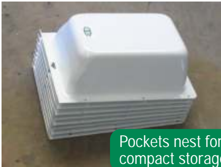
Pockets nest for compact storage

The BP-12 Beam Pocket is formed from a single sheet of steel into a smooth, seamless shape that slips effortlessly out of the concrete. A thin, continuous flange with 6 nail holes simplifies placement and leaves a professional-looking impression in your wall. The bottom flange includes a special locating notch (see diagram below), to make accurate setting of the pocket even easier.