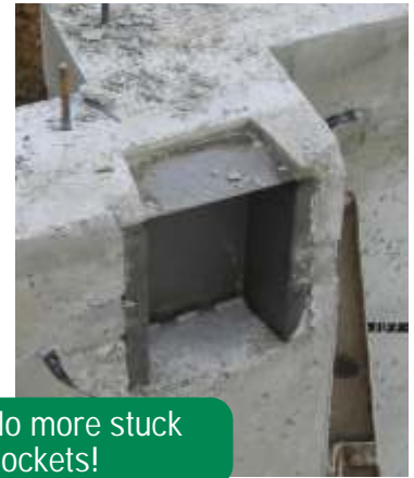
No more stuck pockets!

Try the Steel Dog Beam Pocket and put an end to prying, hammering, and denting. Save money. Save time. Save frustration.